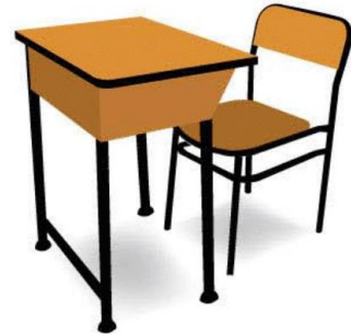
Chair & desk