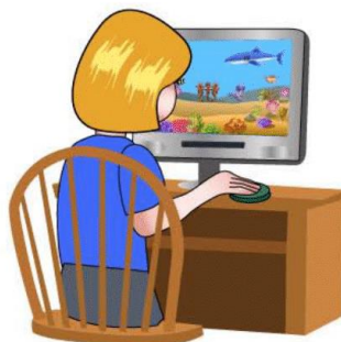
Playing computer games