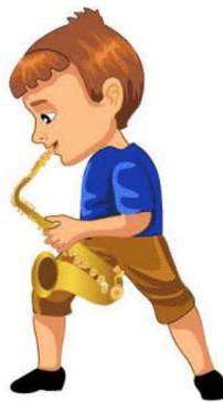
Playing an instrument