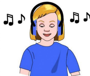
Listening to music