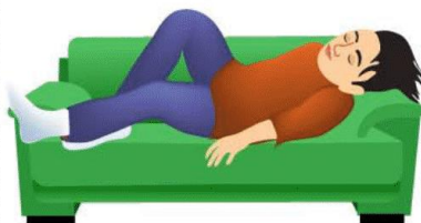
Take a nap