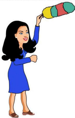
Do the dusting