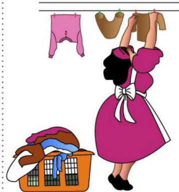
Hang the clothes