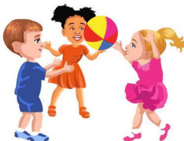
Play with peers