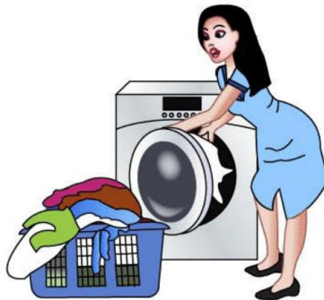
Do the laundry