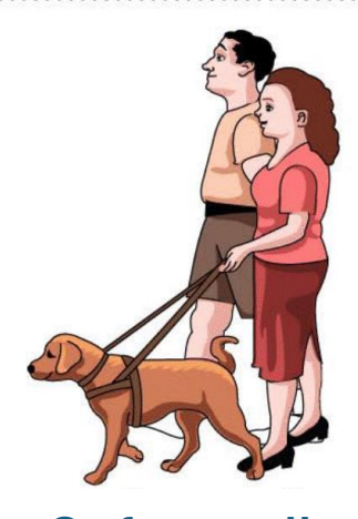
Go for a walk