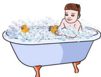
Take a bath