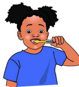
Brush your teeth