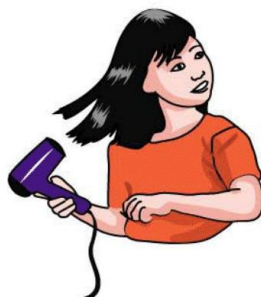
Dry your hair