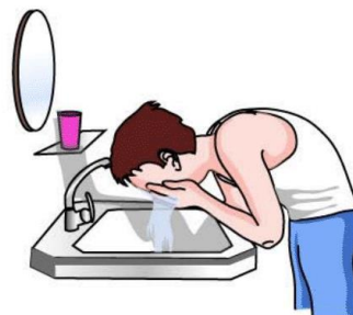
Wash your face