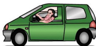
Drive to work