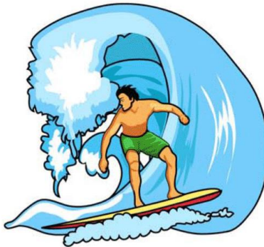
Big wave surfing